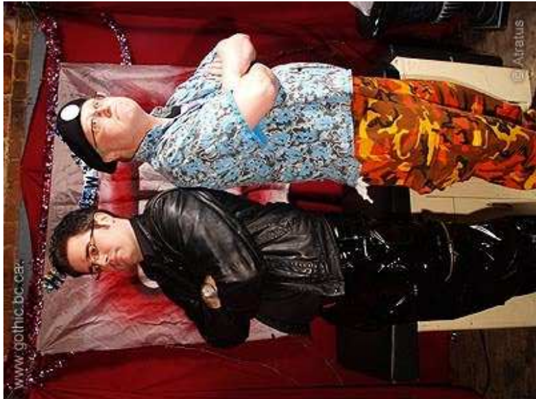
Dudes at Sin City