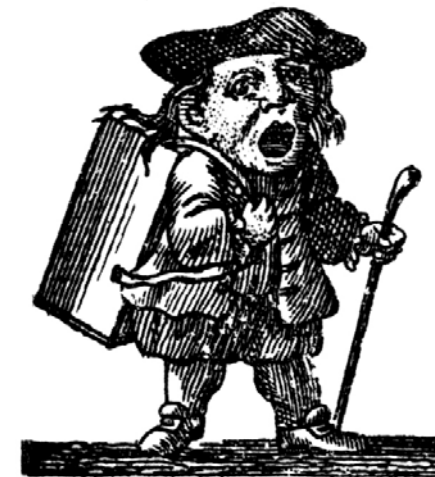
No 44: Read All About It!