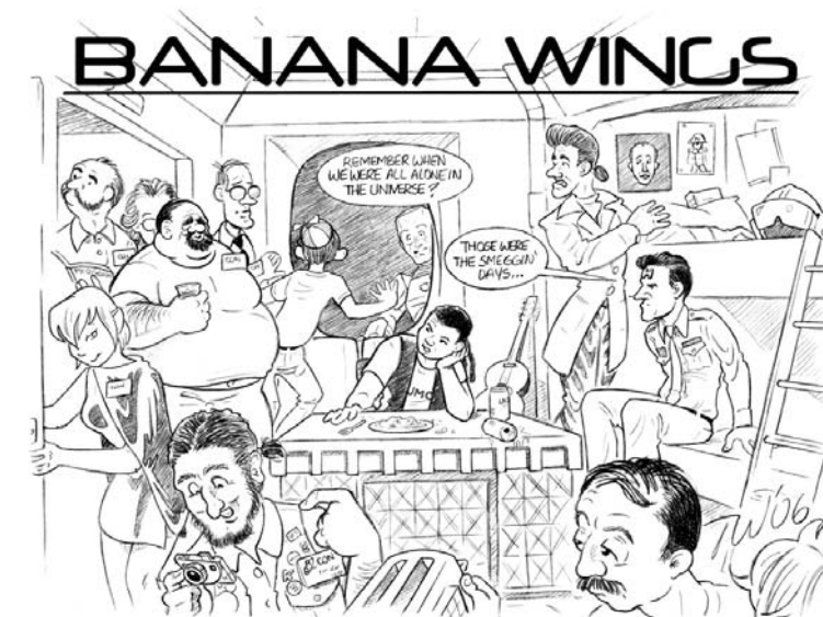
A familiar room party (reprinted from a recent edition of Banana Wings)

Royal Astronomical Society of Canada: Prince George Centre ( http://www.vts.bc.ca/pgrasc/ ) meets on the last Wednesday of the month from August to November and January to May from 7:30 to 9:30 p.m. at the