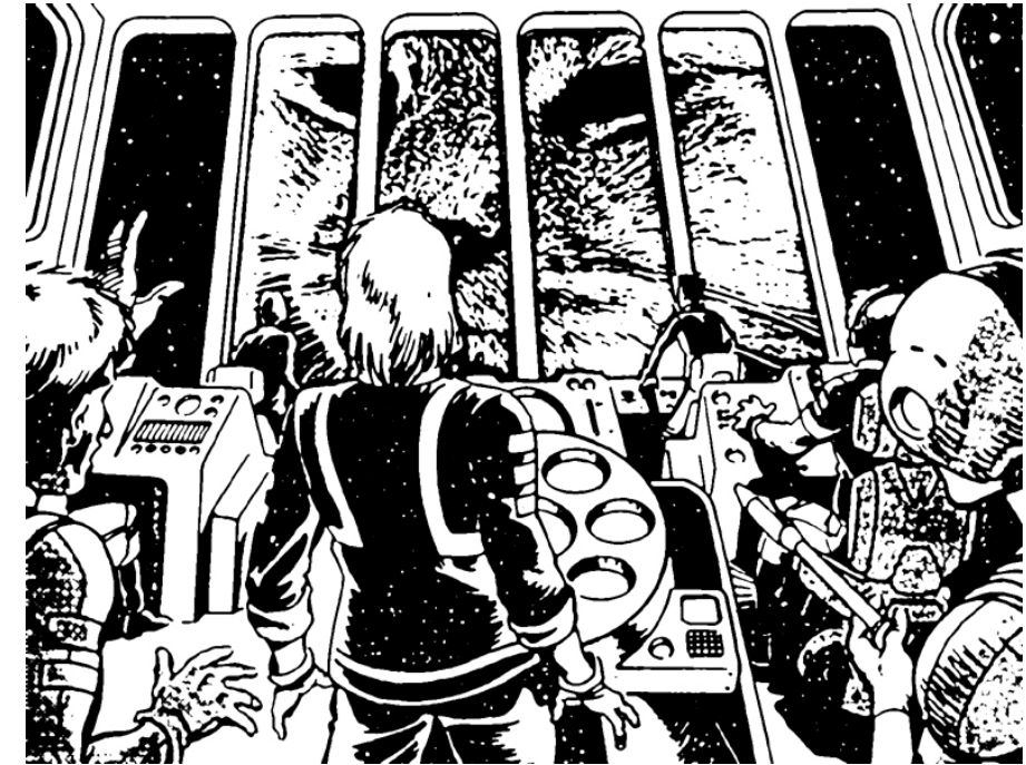
No. 7: Anime Voyagers Meet the Enormous Space Cat