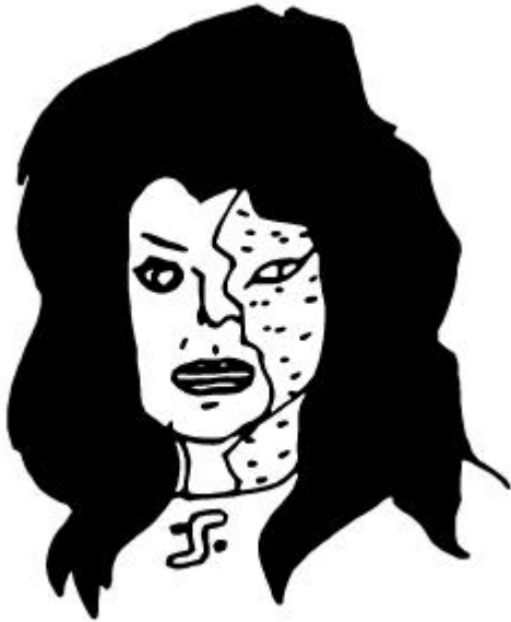
Remember that foolish "V" miniseries?