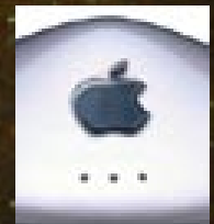
Letter From Helsinki