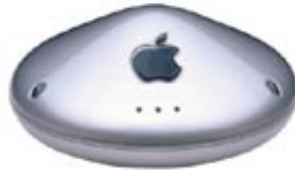
Apple's AirPort for wireless LAN.

In summary, it's an interesting field to be in. This concludes my series of articles for BCSFAzine. Happy new millennium to everyone, but especially to you, dear reader!