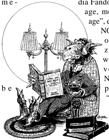
© 1985 BY PANCY MOON - ALL RIGHTS RESERVED

My focus, of course, is Science Fiction zinedom. Though there are cross-overs. I hear there's an American zine called CON-TOUR which, while about SF Fandom, also includes "lusty hotel parties, S/M Klingon mating, vampire dress-up, me -