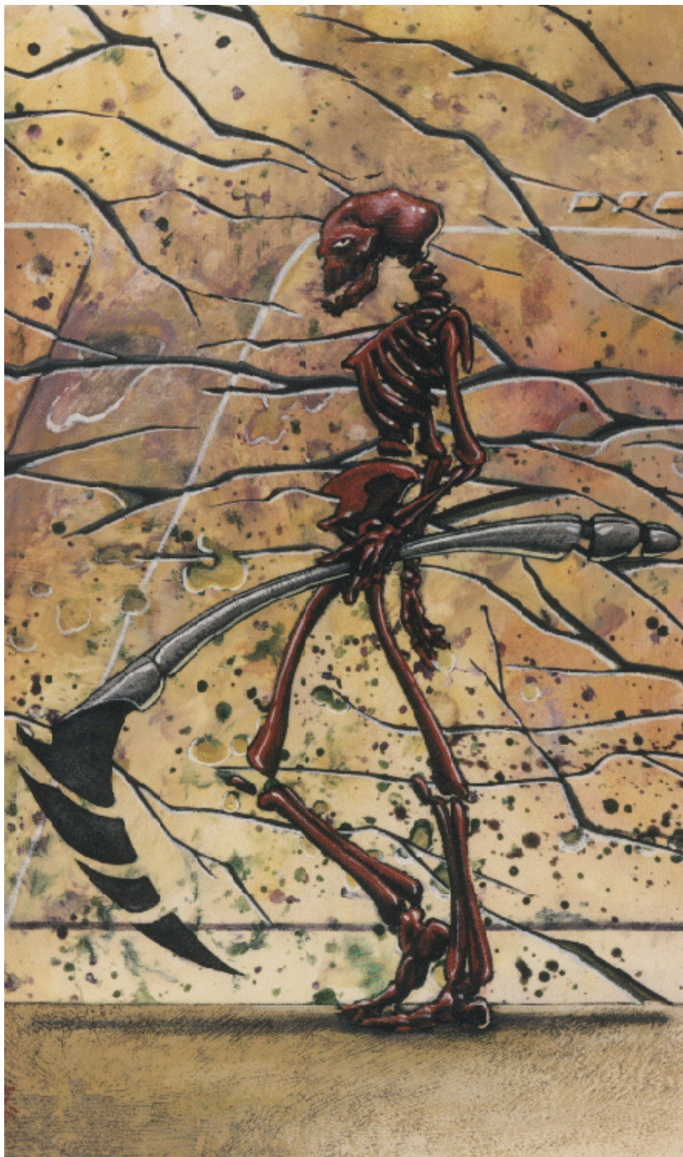
ORIAN BOURNE - ALL RIGHTS RESERVED